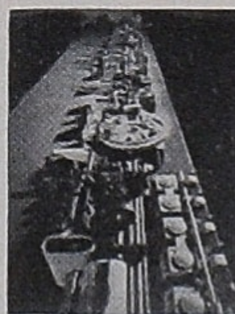
Cover: Model photo of "NEON CITY" by Balthazar Korab (p. 69)

THE ARCHITECTURAL FORUM Vol. 130 No. 3. April issue.